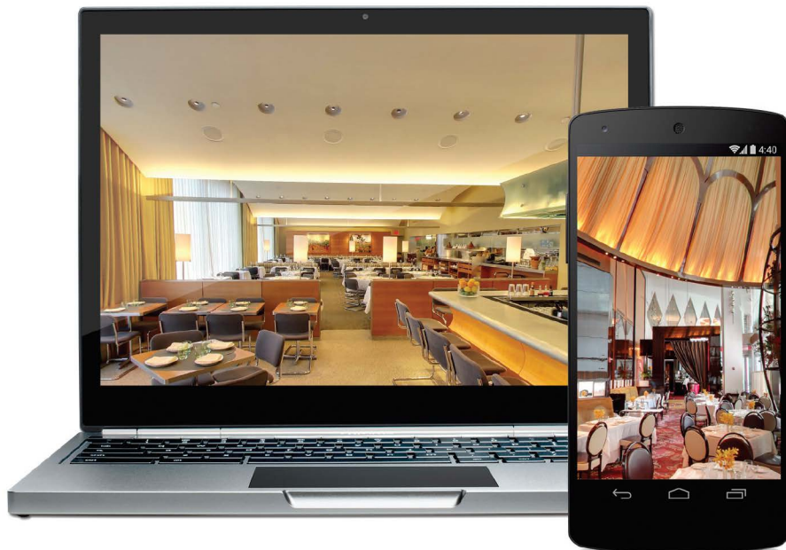
Tour business interiors with Google Maps Business View on desktop, mobile, and tablet devices