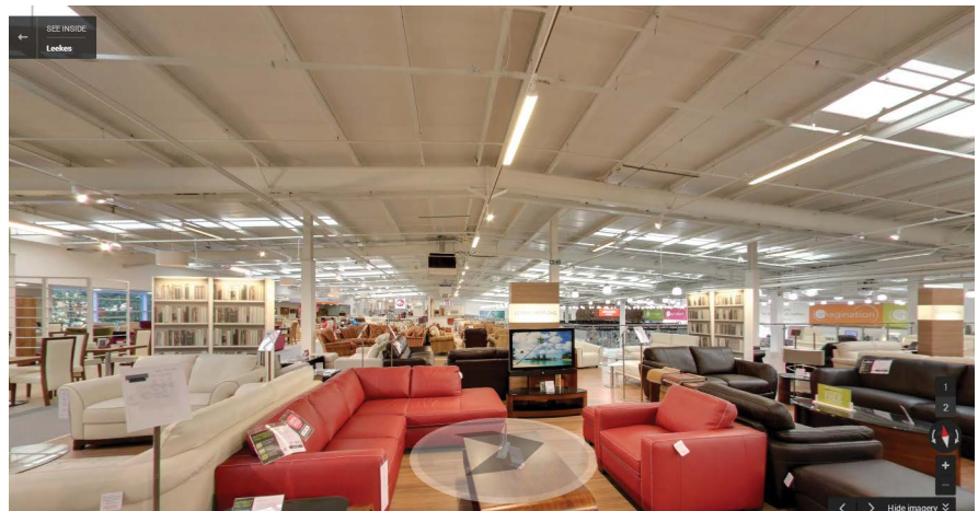
Business View in the Leekes Coventry store.